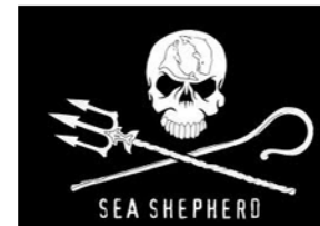
(Sea Shepherd Conservation Society)