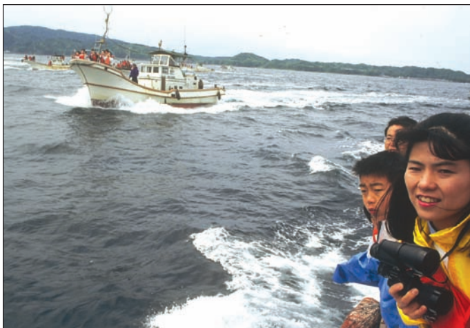
Too many boats can harass the whales and detract from the tourist's experience—instead of whale watching, it becomes boat watching.

In addition, a program of research and monitoring should build on and be able to compare results with the baseline research (point 3). This will not only reveal the fascinating behavior and biology of the cetaceans being watched—of great interest to operators, guides, local community members, and whale watchers—but also may indicate whether the whales or dolphins are declining due to pollution, fishing gear entanglements, or bycatch or even if they are bothered by whale watching and their short-term behavior or long-term conservation is being affected. Results then need to be considered as part of periodic revisions of management plans.