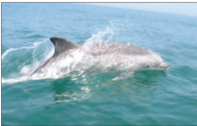
Supporting local dolphin research helps boat operators learn more about the animals and how to protect them.

2. Devise and implement stakeholder involvement strategies. One key to sustainability is keeping the stakeholders involved in helping to manage the resource. Strategies for doing this include regular meetings (sometimes before and after every season), dolphin or whale festivals and other special events, and programs to encourage stakeholder investment in research, education, and conservation of the resource (whales, dolphins, and the marine ecosystem). It is essential that the stakeholders meet to evaluate the success or failure of their efforts and to improve their plans and develop new strategies.