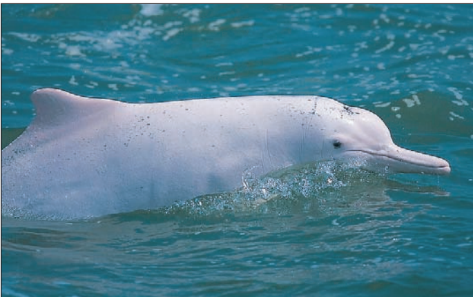
SAMUEL HUNG, HONG KONG DOLPHIN CONSERVATION SOCIETY

One large boat carrying many passengers is less intrusive than many small boats with a few passengers each.