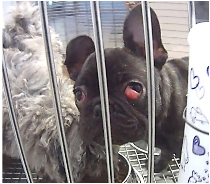
A puppy in Petland Novi was suffering from “cherry eye,” a condition that requires surgery.

An HSUS undercover investigator worked behind the scenes as a kennel attendant at the Petland store in Novi, Michigan, where a hidden camera captured sick puppies, questionable veterinary care and unsafe conditions. The investigator also visited eight additional puppy-selling pet stores in the state as a “shopper.” The investigation took place beginning in July 2023 and continued for several months. Evidence studied by HSUS researchers revealed that all 12 of the stores for which records were available were selling puppies from out-of-state commercial breeders, also known as puppy mills, many of which had state or federal violations for issues such as dogs with bleeding wounds, and sick, injured, dirty or matted dogs. Many (at least 10) of the dealers supplying puppies to Michigan pet stores had such egregious animal welfare violations that they were listed in one or more of the HSUS Horrible Hundred reports on problem puppy mills.