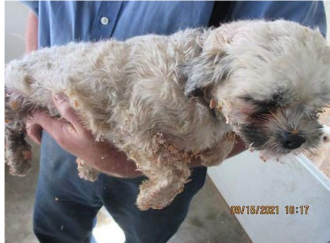
In 2021, USDA inspectors found a dog who was suffering from three large lacerations at Vernon Bontrager's Grand Valley Kennels in Wisconsin. The state also inspected in 2021 and noted that newborn puppies died in the kennel after being attacked by other dogs. The breeder sold to the Barking Boutique.

The complete list of the nine stores and locations visited in person with an undercover camera is: