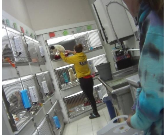
Some Petland staff said that puppies sometimes fell from the higher cages and hit the hard floor. Staff captured on undercover camera described at least one puppy who fell and broke a leg.

“A customer complained [a poodle puppy] was sick while playing with him at about 11:00 am. At that time he was lethargic, weakly coughing with only some clear snot, and shivering, when before nobody had noticed any odd behavior.”