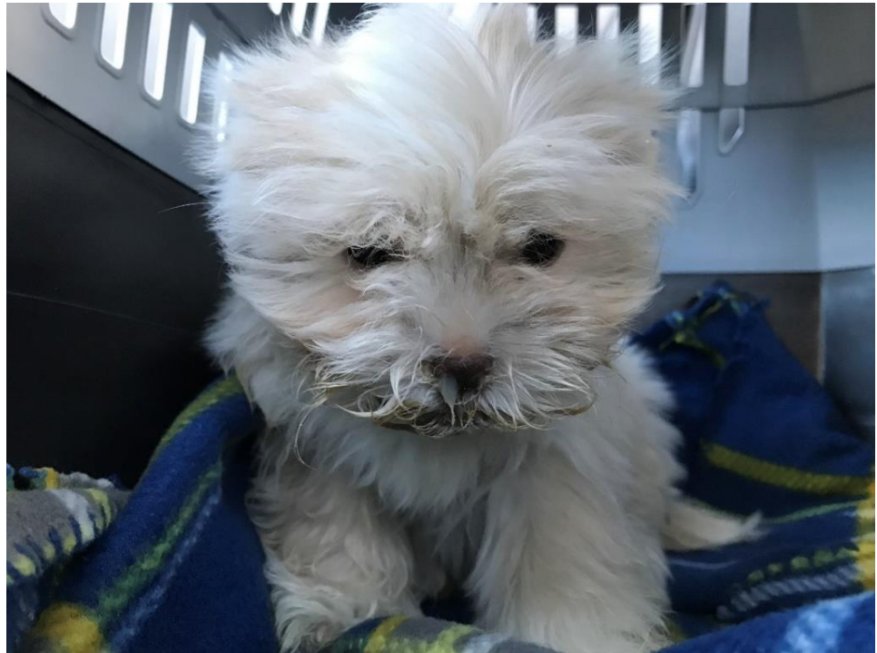
A very sick puppy in the Florence Petland store was finally taken to the veterinarian, but never returned. Investigators suspected he was taken much too late and did not survive.

Two days later, the HSUS investigator was informed that customers could not interact with any puppies in the store until test results for three puppies suspected of having canine distemper– the customer’s sick Yorkie, a very