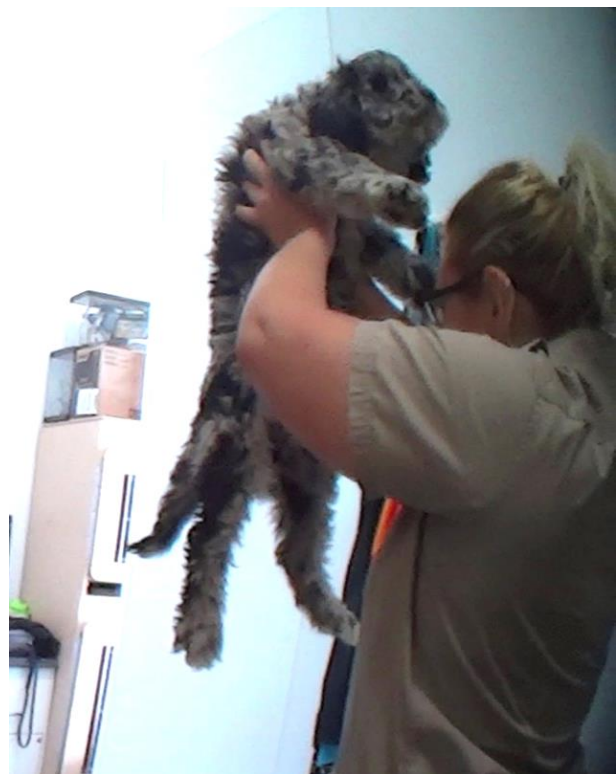
A merle goldendoodle puppy (later named Jasper) arrived at the store from an Ohio distributor on Sept. 26, 2019. He was underweight and suffered from frequent diarrhea for weeks, but Petland didn’t provide adequate care for his illness.

In fact, when an HSUS secret shopper purchased a puppy, whom we named Jasper, with obvious diarrhea on Oct. 25, 2019, a Petland manager assured our buyer that the puppy was healthy and that his diarrhea was simply due to stress. The manager told our puppy buyer on hidden camera, “this puppy has had diarrhea [but]