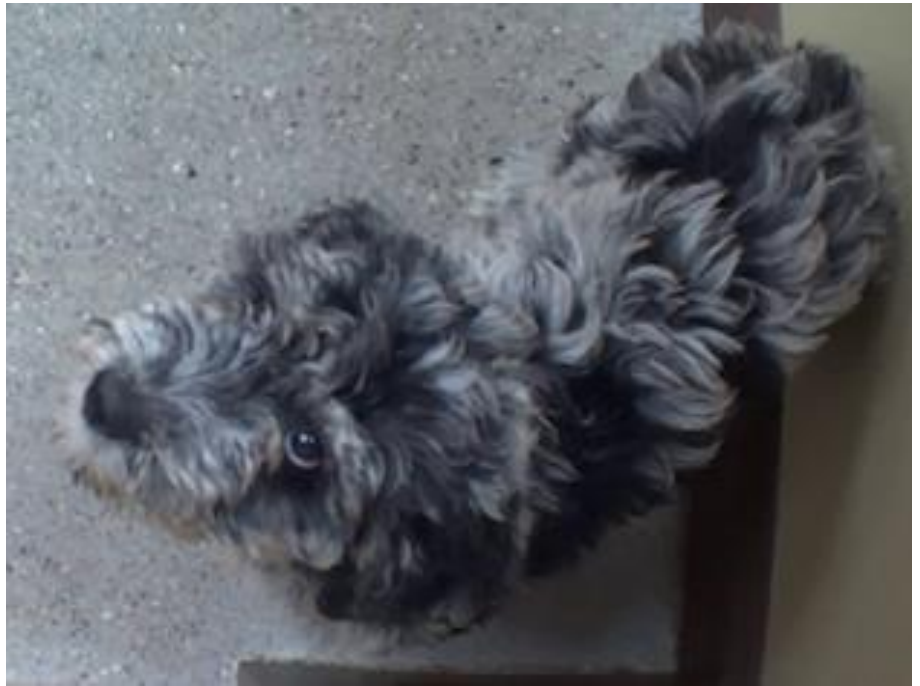
After HSUS purchased Jasper and a veterinarian administered appropriate treatment, he gained three pounds in less than a week. / HSUS, 2019.

because of improper or ad-hoc veterinary care, and because their brand-new immune systems are no match for the dirty and crowded conditions at puppy mills. The puppies’ immune systems are also stressed by days on long transports as they are moved by brokers (distributors) to pet stores on crowded vehicles, where they are exposed to many other puppies who might be sick. During our investigation, several tiny puppies were sent back to the breeders due to a variety of ailments, including several who had open fontanels – openings in the skull that could increase the risk of brain injury.