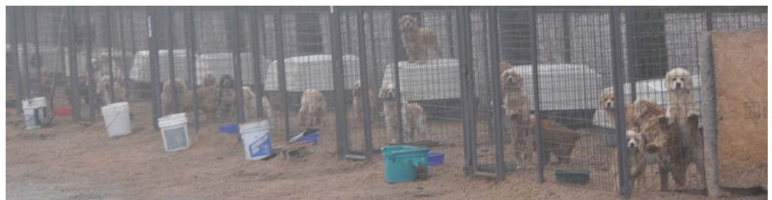
Note the lack of shade in these enclosures at the Ratzlaff's kennel.

USDA violations documented at the Ratzlaffs’ kennel include a dog with hair loss and