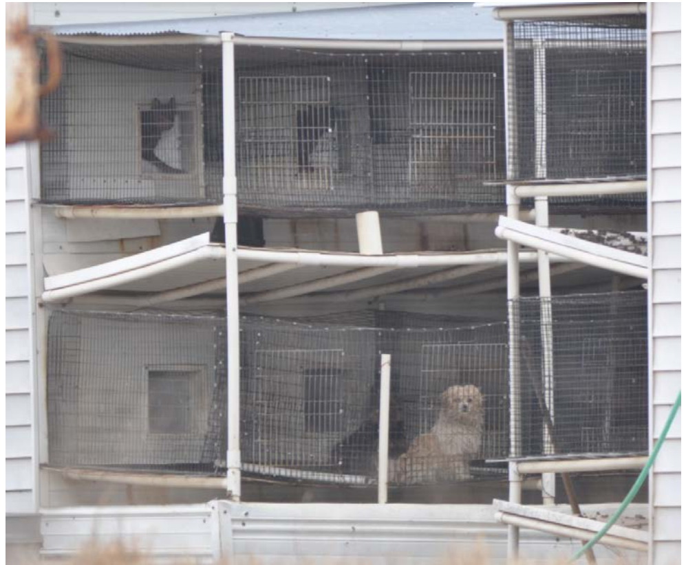
Dogs in small, stacked cages at Rainbow Ranch Kennel were seen gazing out at open, grassy plains in which they could not run and play.

In September 2011, Rainbow Ranch received an Official Warning from the USDA for violating the Animal Welfare Act regulations. This warning cited six non-compliances from different inspections during the years 2009-2011, including a direct noncompliance for failing to provide veterinary care. This issue refers to a June 2011 inspection where the inspector found ten animals in need of immediate medical attention: a Chihuahua who “has a sagging appearance to his lower jaw,” five boxers and a pug that “have wounds at the base of the ears” with flies buzzing around them, a schnauzer that had a wound on the left side of his body that oozed a “thick, bloody discharge” when the inspector palpated it, a Boxer with “patchy hair loss on her chest, shoulder areas, and sides,” and an English Bulldog that had a “pink, fleshy mass in the corner of the right eye.”