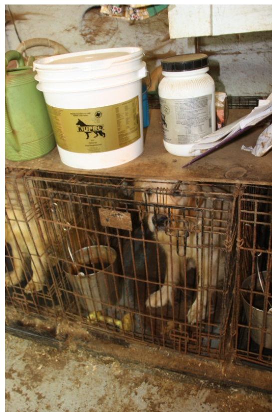
Animal control officers found deplorable conditions at Chien d'Or Kennel in Farmington Hills, MI. The kennel has registered AKC breeding stock and sells online. In recent years, the AKC has opposed more than 100 bills designed to crack down on puppy mills.