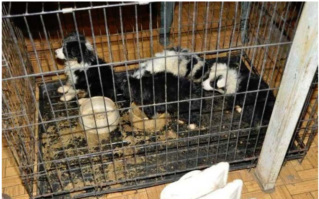
USDA inspectors photographed these puppies in a feces-smearred crate at Janelle Yates’ Cloverleaf Kennel in Willow Springs, MO. One of the puppies was witnessed stepping in the feces and then stepping into the food bowl, and the inspector noted that there appeared to be small white worms in the feces. Numerous additional problems were found in 2013.

attempted to return twice to check on conditions but were not given access to the kennel. The problems found included matted dogs and dogs with veterinary problems, broken and unsafe cages with holes in the flooring, dirty food and water